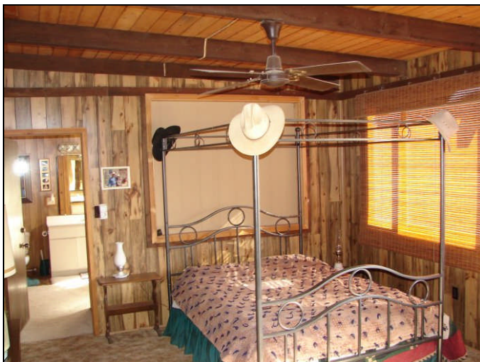
Good place to rest