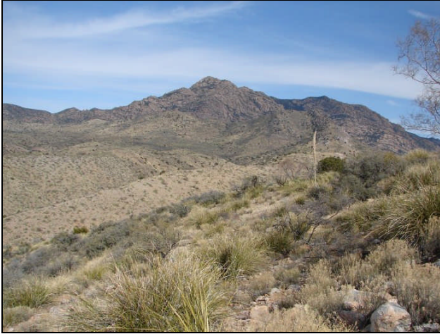
Typical State lease