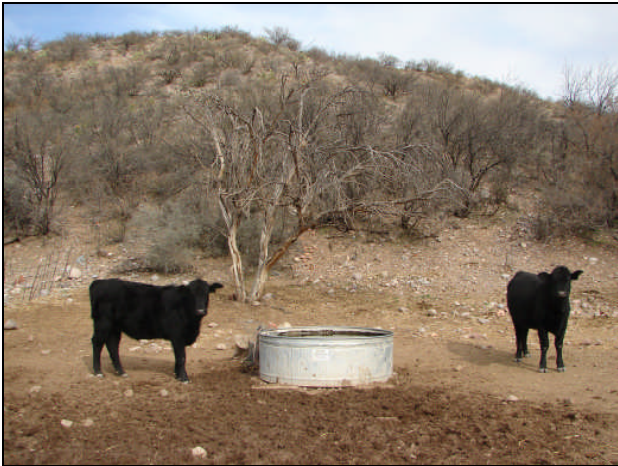
Content calves at Headquarters