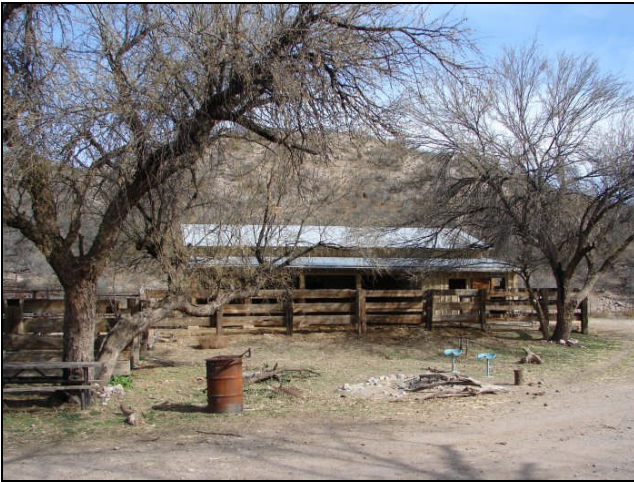
Hay barn with saddle room and covered pens