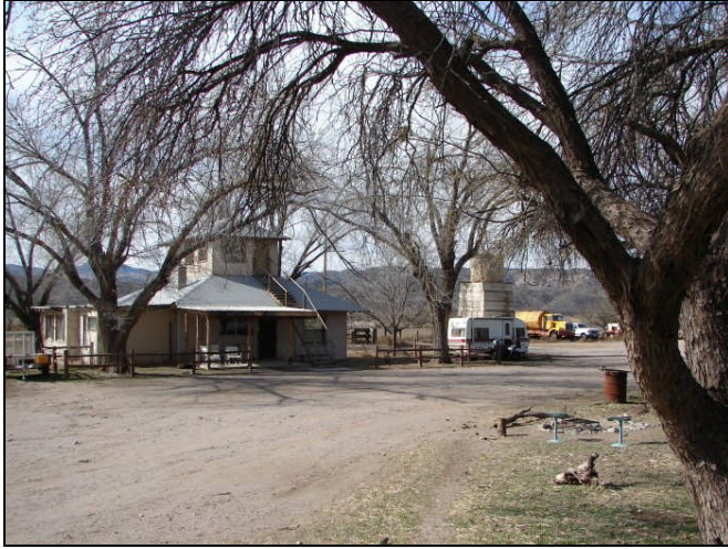
Comfortable 3 bedroom, 2 3 / 4 bath owners home.