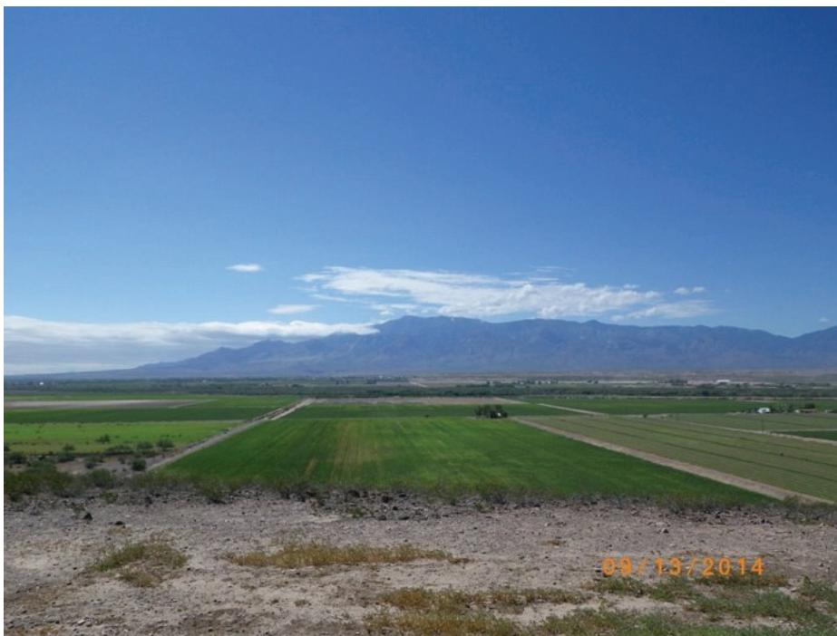
Another panoramic view

Disclaimer: This information was obtained from sources deemed to be reliable but is not guaranteed by the Broker. Prospective buyers should check all the facts to their satisfaction. The property is subject to prior sale, price change, or withdrawal.