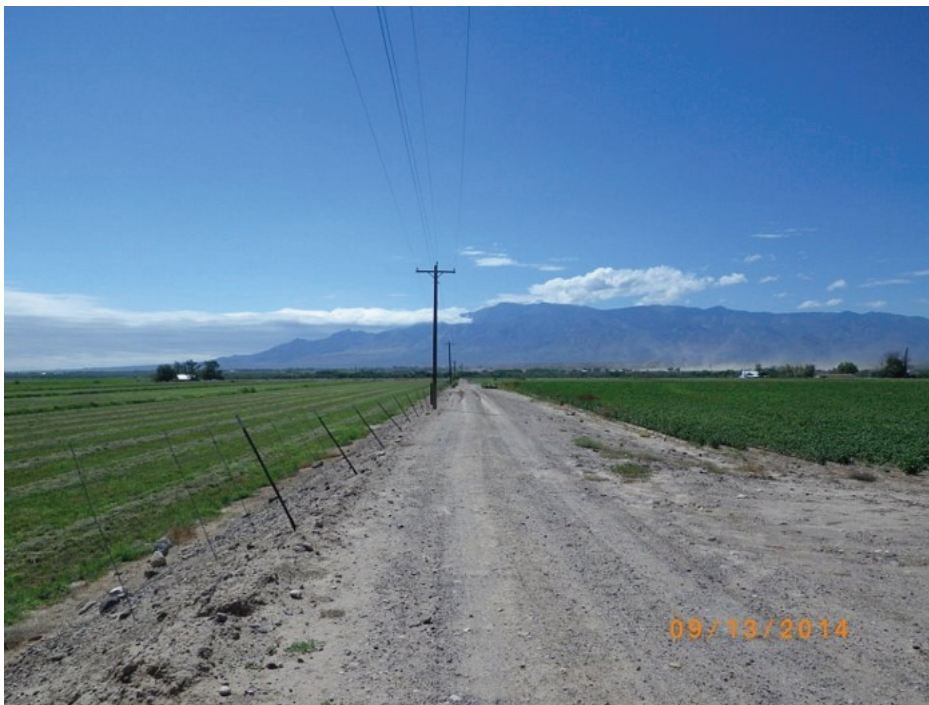
Cotton And Alfalfa (Mount Graham in the distance)

Disclaimer: This information was obtained from sources deemed to be reliable but is not guaranteed by the Broker. Prospective buyers should check all the facts to their satisfaction. The property is subject to prior sale, price change, or withdrawal.